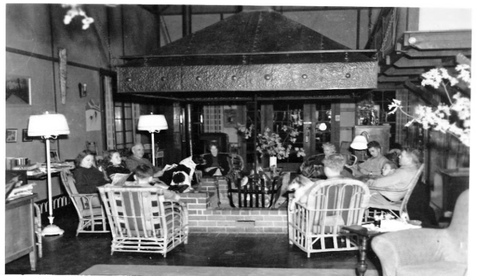
Lobby of Wrightwood Lodge - showing Open Central Fireplace

(continued - see "The Wrightwood Lodge" on page 4)