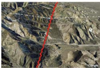
View of Swarthout Valley following the San Andreas fault (red line) as it heads NW through Wrightwood.

A team made up of the Wrightwood Disaster Preparedness Team (WDPT), Wrightwood Fire Safe Council (WFSC), Wrightwood Communications Group (WCG), Wrightwood CERT (WCERT), and San Bernardino County ECS spent exactly 60 days planning the Wrightwood Golden Guardian Disaster Exercise (WGGDE).