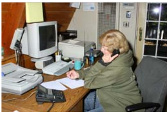
The Phone Bank ladies answered over 500 calls during Wrightwood's Golden Guardian Exercise. Logging over 1,400 Check-Ins!