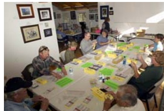
Volunteers prepare community notification door hangers and emergency magnets.