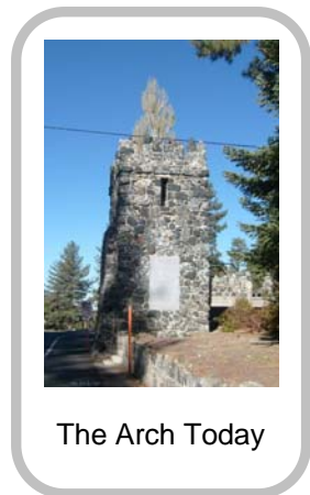
The Arch Today